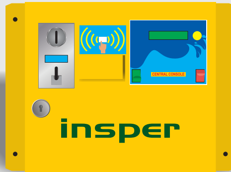
SMART CARD BASED